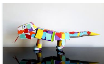
Camouflaged Lizard Joey, Age 5

You can download the guidelines for submission via this link: https://yass.s3-eu-west-1.amazonaws.com/Submission-Guidelines-2022.pdf