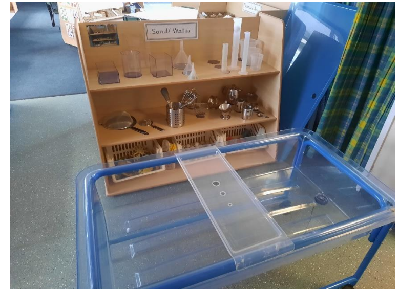
Foundation 2 Classroom