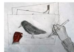
Blackbird on a Branch Georgia, Age 8

I really like maps and geography. A while ago I created an imaginary country called Yay. I drew lots of maps of this country and changed it as I got new ideas. This map is of the main island of Yay, called Vazuliland. I got my inspiration from looking at real maps but I use my own style.